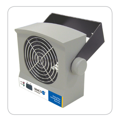
The Model 6432e is offered either with a smaller in-tool stand (shown here) or a larger benchtop stand, shown in the photo on the front of the datasheet.

For increased flexibility, the Model 6432e Blower can be directly powered by process equipment or 24 VDC/VAC power to fit the needs of your environment. For 100-120 VAC input power, use transformer #14-1420-01; for 230 VAC, use #14-1430-01; and for applications where DC input power is preferred, use #14-1322 or another 24 VDC source (performance will be reduced using DC power).