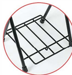
L500-21 L500-22 L500-23 (Stand)