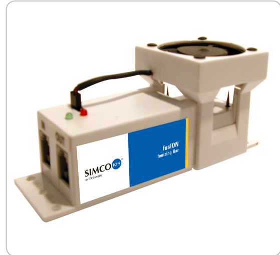
fusION with Fan Attachment

The performance of any ionizer, including fusION, can be improved with the addition of controlled airflow. In applications that may benefit from improved airflow, an optional fan assembly is simply clipped to the fusION housing and power to the fan is supplied through a built in connection.