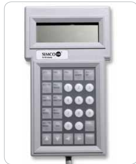
The Handheld Terminal Model 5571 allows extra settings and remote management.

When integrated with a facility monitoring system, setting the polling periods enables the user to control the amount of data collected; setting the retry periods reduces false alarms from communication errors.